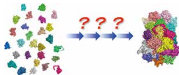
Figure 1. Formation of supramolecular machinery through dynamic assembly and disassembly of biomolecules.

Toward an integrative understanding of the principles behind the biomolecular ordering processes, we conduct multidisciplinary approaches based on detailed analyses of