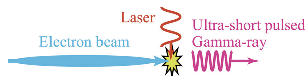
Figure 1. Schematic illustration of 90-degree laser Thomson scattering.

A positron is an excellent probe of lattice defects in solids and of free volumes in polymers at the sub-nm to nm scale. GiPALS enables defect analysis of a thick material in a few cm because positrons are generated throughout a bulk material via pair production. Our group is conducting research on improving the properties of the material by using GiPALS.