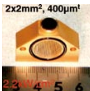
Figure 1. Microchip laser developed at the center.

main targets are (1) advanced photon sources covering wide energy ranges from terahertz to soft X-ray regions; (2) novel quantum-control schemes based on intense and ultrafast lasers; and (3) high-resolution optical imaging and nanometric microscopy. The center also serves as the core of the joint research project "Extreme Photonics" between IMS and RIKEN.